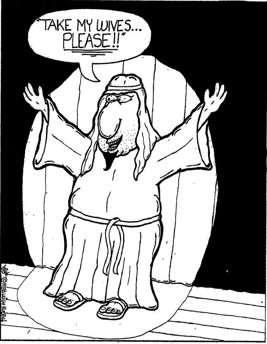
At the Arabian comedy club.