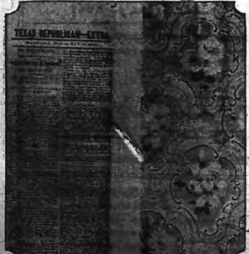
SHAPED AT CHICAGO—A picture of a portion of a newspaper that was printed on Webpage during the Civil War. This was obtained by the courtesy of some print paper at this time.