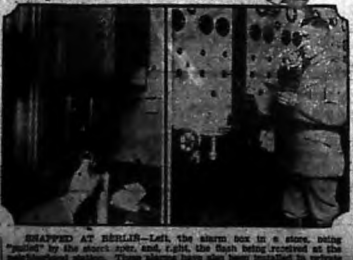
SHIPPED AT BIRMINGHAM--Left, the alarm box in a store being "piped" by the electric wire, and, right, the alarm being received at the neighborhood station. These alarms have also been installed in private residences.