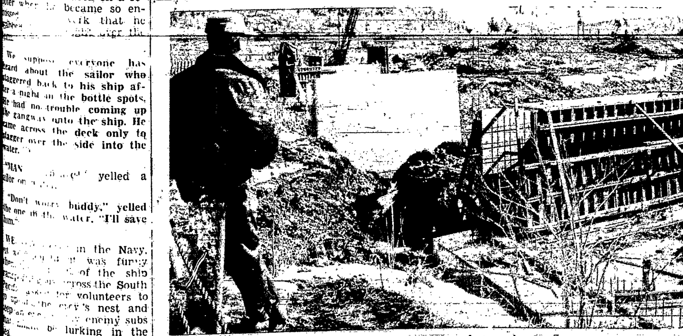
MAJOR PROJECT — An interested spectator watches construction workers build foundations for bridge on new Route 88 project to Sodus, just north of here.