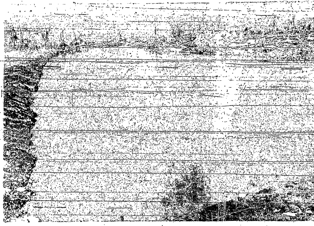
NEW WATERWAY — Flow of Ganargua Creek is being diverted in construction of bridge on new Route 88 North project, north of Newark.

The Men's Club of the Redeemer Evangelical Lutheran Church will meet Tuesday at 7:30 p.m.