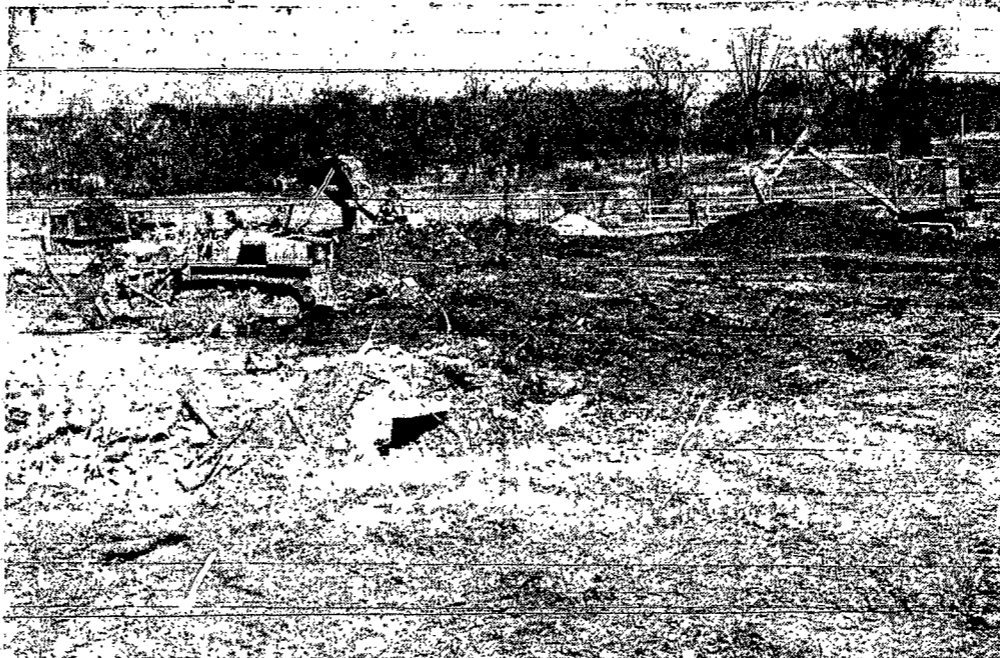
WHERE DID IT GO? — Bulldozers clear site which once contained large glasshouse at village sewage disposal plant on Murray St.

731 N. Main St. Newark, N.Y. Dial 331-3005