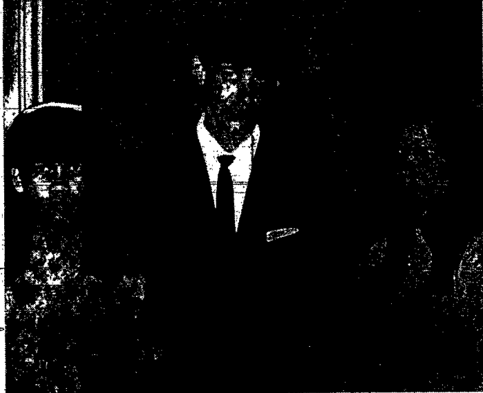
GUEST SPEAKERS — A.F.S. students were guest speakers at the annual Student Court and Student Council awards dinner held on Wednesday, May 8. Left to right are students from the Philippines, Germany and Paraguay.