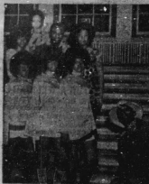
THE SHOW STOPPERS COMEDY TEAM