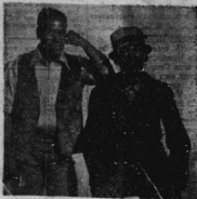
FLASH AND BOO-BOO